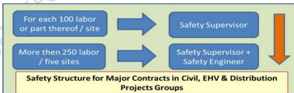
Annexure 3.6 (Refer Para 4.0)