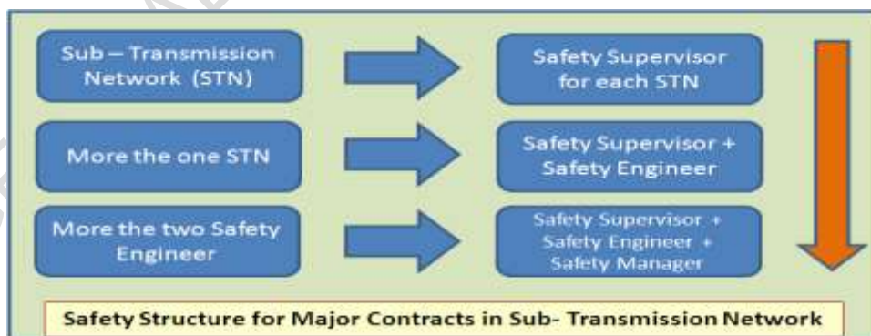
Annexure 3.5 (Refer Para 4.0)